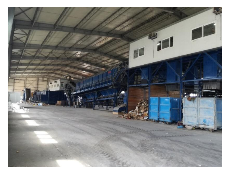
Materials recovery facility at the Livade landfill site in Podgorica.

Sanitary municipal waste landfills are in operation at Podgorica-Livade and Možura by Bar. In addition, it is estimated that there are around 150 uncontrolled illegal landfills where MSW as well as construction and demolition waste and other wastes, such as WEEE and tyres, are dumped.