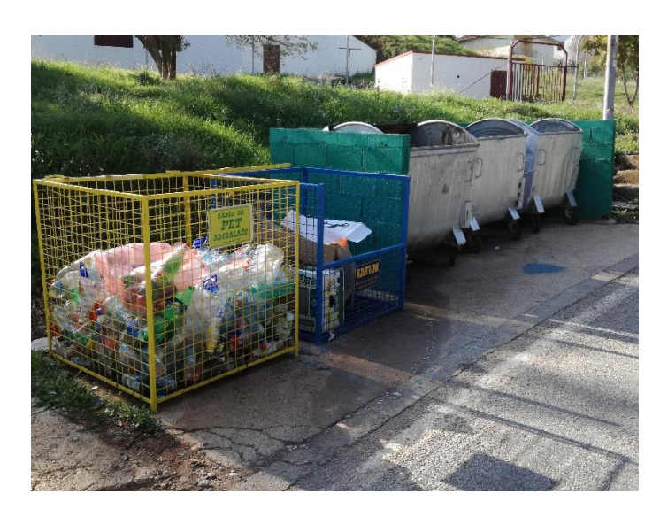
Separate collection of PET, paper/cardboard and residual waste in Tivat.